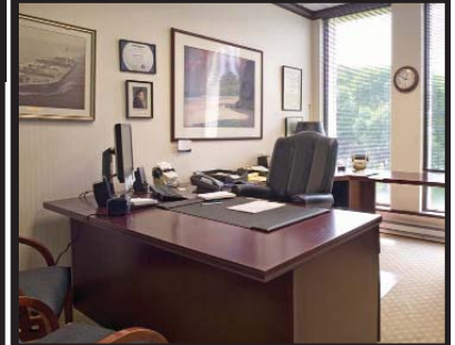
25 B Hanover Road